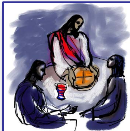
They Recognized Him.